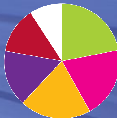
Sales By Main Product