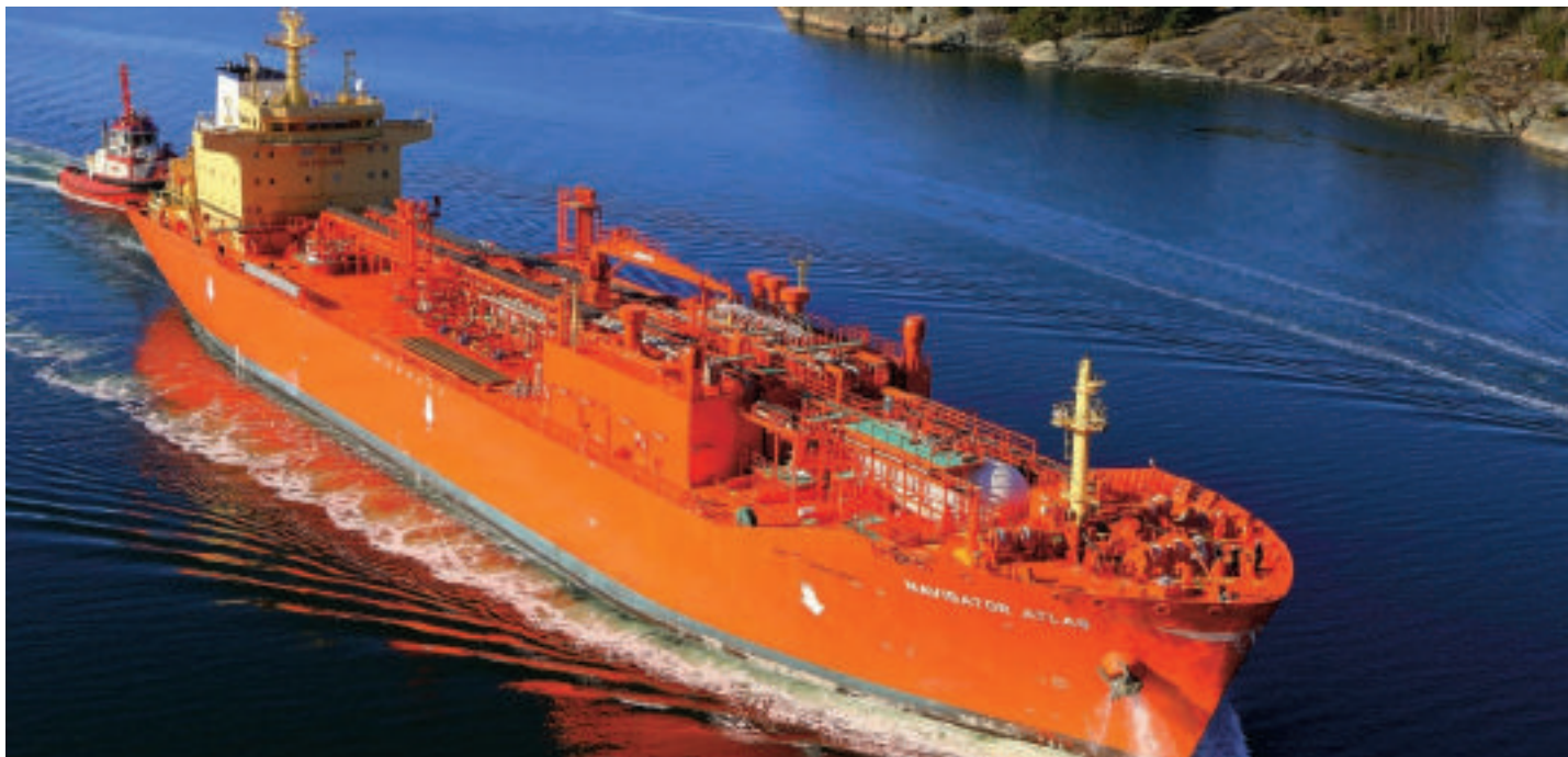
Ethylene exports from the US look set to ramp up as a wave of new crackers and downstream units are being built and come on stream